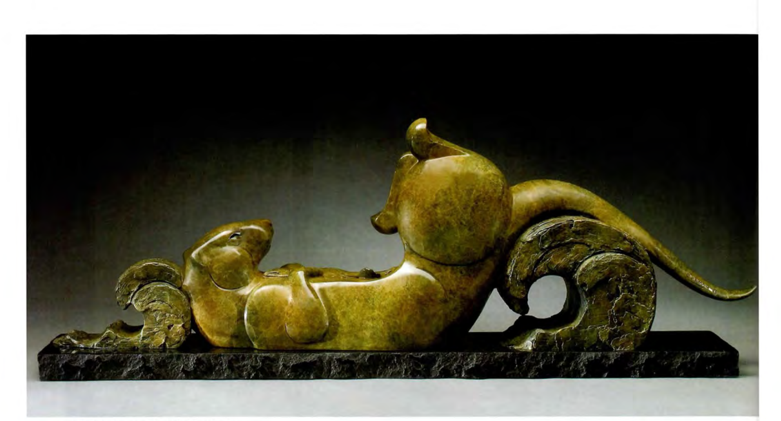
Fish Dish, bronze, ed. of 18, 33 x 12 x 5"