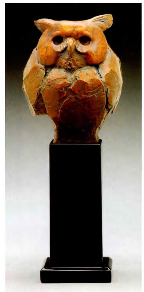
Wise Guy, bronze, ed. of 18, 15 x 6 x 4"