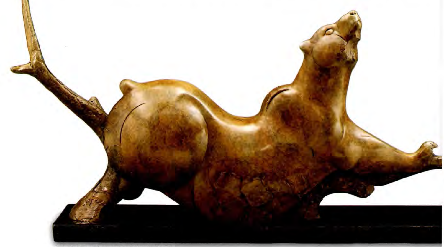
Branch Bender, bronze, ed. of 18, 17 x 38 x 7"

Simply Swan, a bronze in the exhibition, appears to be carved from stone with its pale patina and dark beak. The patina of the body is mottled enough to suggest feathers and more form than exists physically in the sculpted shape. Cherry comments, "With the smooth surfaces I have a large palette of options available, since my work leans toward a more contemporary style, I enjoy experimenting