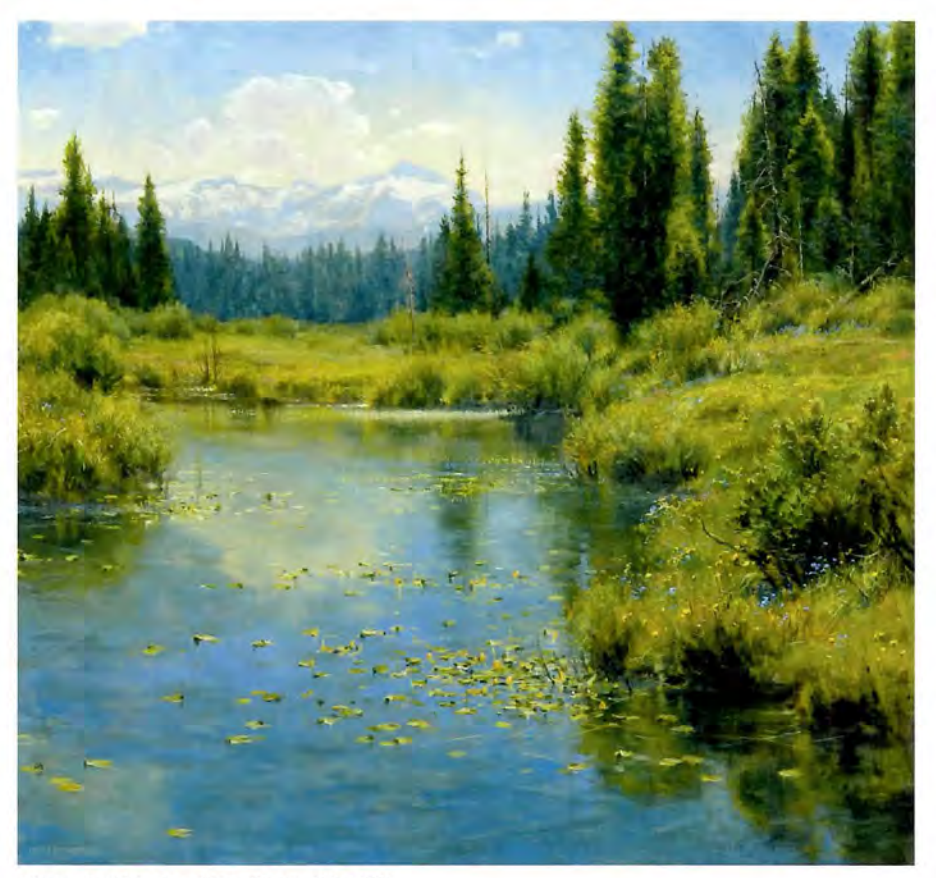
Western Waters, oil on linen, 28 x 30"