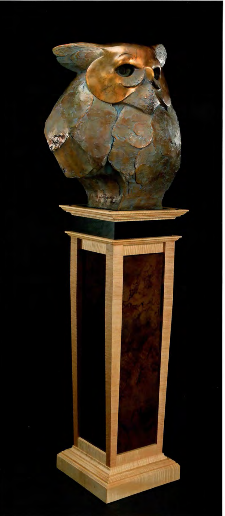
Wise Guy, bronze, 66" high by 17" long