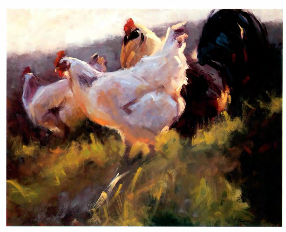
"The Great Chicken Drive, oil, 24" × 30"

in Seattle. At one point she discovered oil painting and never looked back.