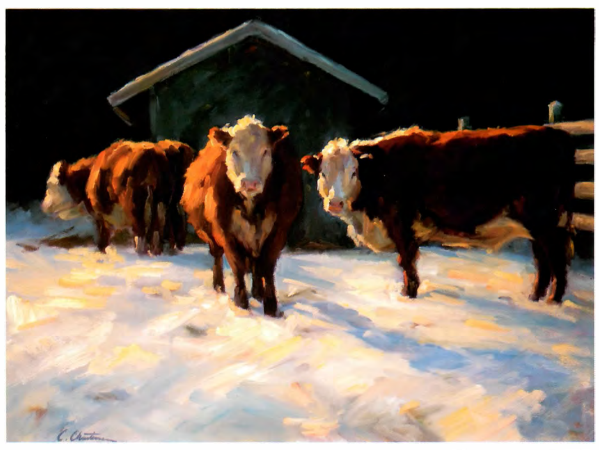
"Winter Light," oil, 24"×36"