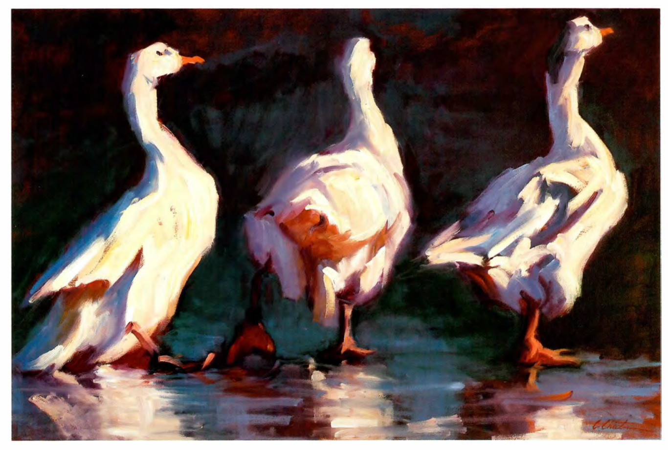
"On Thin Ice," oil, 24" × 36"