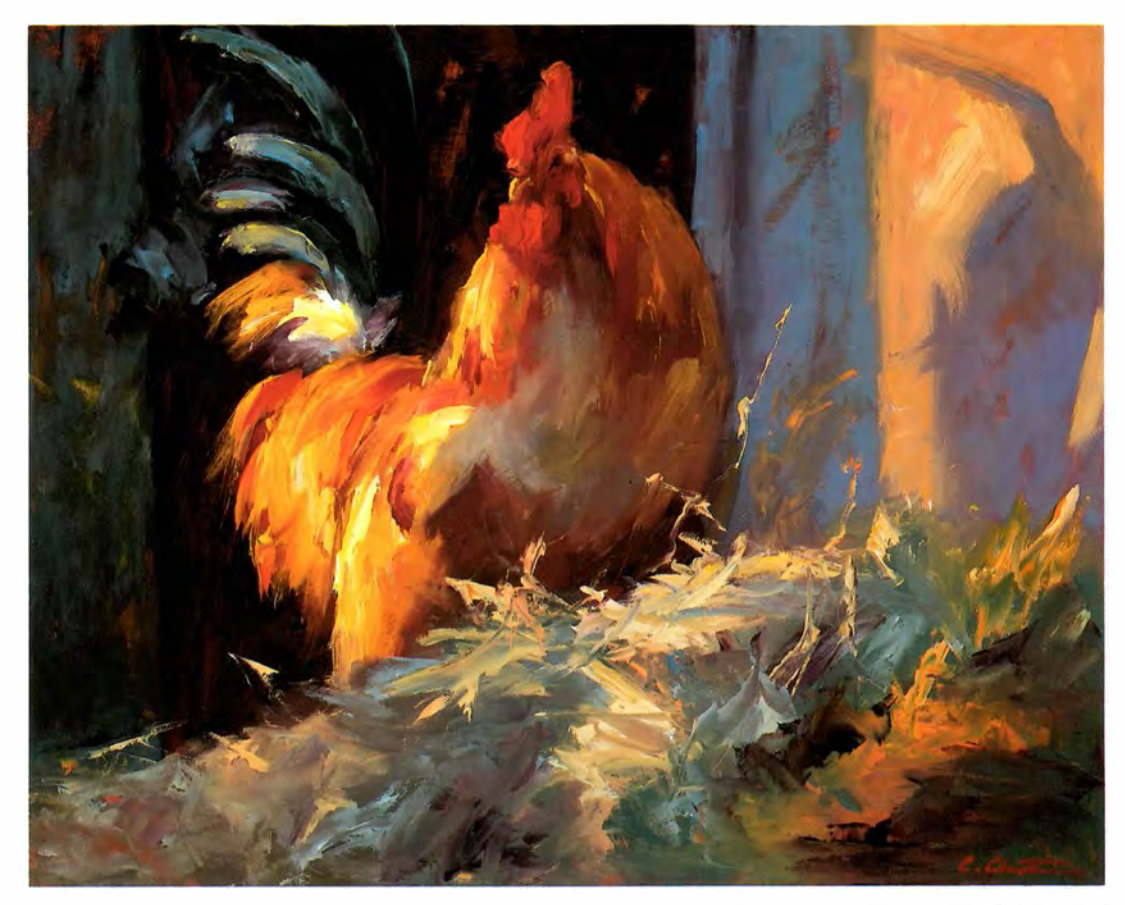
"Banty in the Haystack," oil, 16"×20"