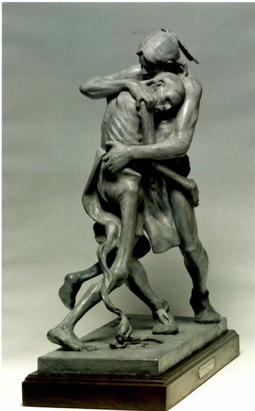
The Ghost Wrestler