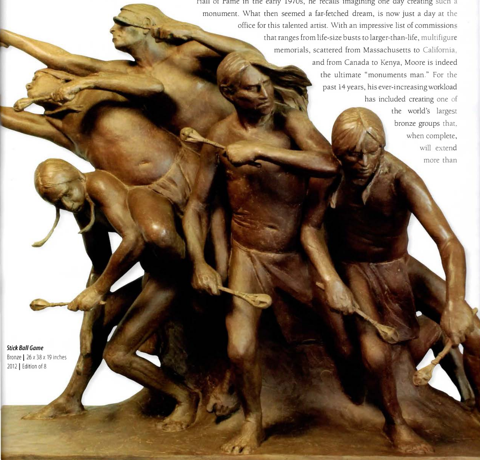
Stick Ball Game Bronze | 26 x 38 x 19 inches 2012 | Edition of 8

has included creating one of the world's largest bronze groups that, when complete, will extend more than