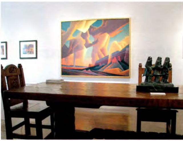
19 A work by Ed Mell on display at Owings-Dewey Fine Art.