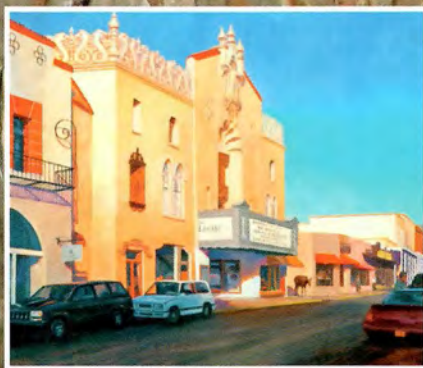
Bruce Cody, Lentic Light - September, oil on canvas, 32 x 36" THE PETERSON-CODY GALLERY