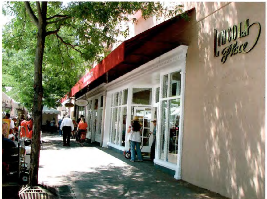
14 Blue Rain Gallery now has two vast exhibition spaces.

Blue Rain Gallery recently expanded and improved its Santa Fe location on Lincoln Street by adding 4,800-square-feet of display space.