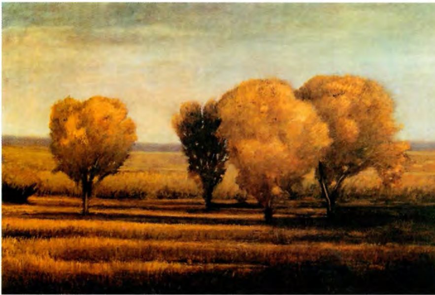
10 Brandon Cook, Fall Arrangement , oil, 32 x 48" – Ventana Fine Art