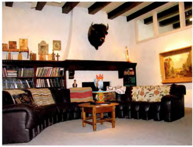
19 The interior of Owings-Dewey Fine Art, which grew in 2000 to include an additional exhibition space two blocks from the main gallery.