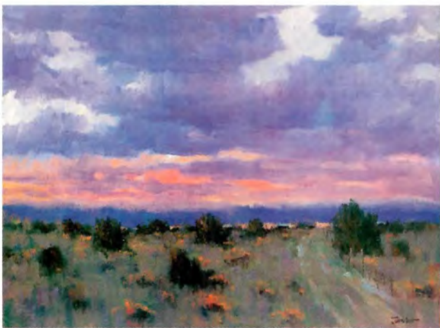
6 Don Brackett, Prairie Sky , oil, 22 x 28" –Meyer Gallery