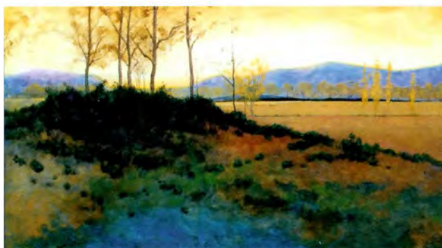
8 Kirk Tatom's show at the Selby Fleetood Gallery includes this piece, Rio Dawn , oil on panel, 27 x 47."