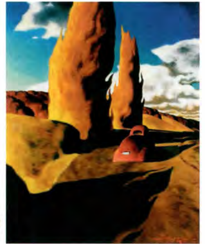
16 Z.Z. Wei, Sunny Day Drive , oil, 60 x 48"—Manitou Galleries