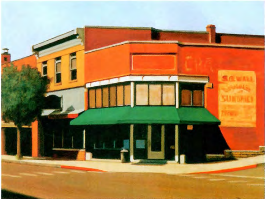
20 Susan Romaine, Green Awning , oil, 18 x 24" – Peterson-Cody Gallery

One of Southwest's finest art galleries, the Peterson-Cody Gallery specializes in Contemporary Representational art and offers a selection of paintings and sculpture from more than 20 artists from across the United States and Canada.