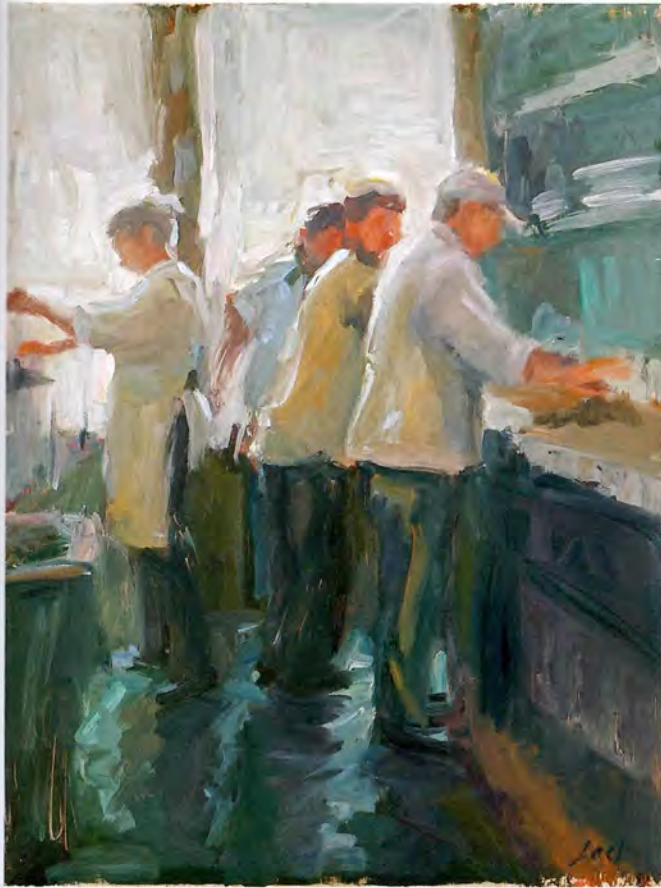
BOULETTES LARDER, OIL ON BOARD, 16 X 12"