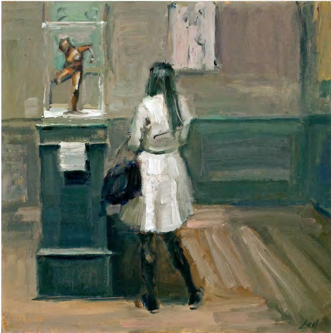
STUDYING DEGAS, OIL ON BOARD, 12 X 12"