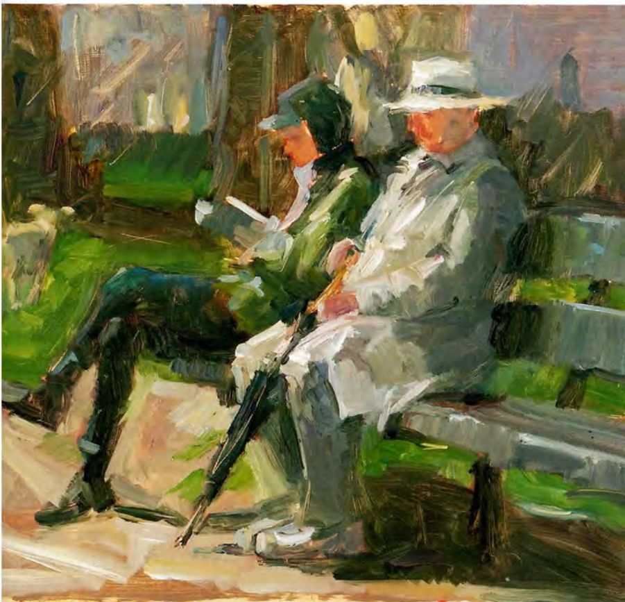
BLUSTERY DAY, BROOKLYN, OIL ON BOARD, 10 X 12"

artist, if her paintings were larger they could lose their intimacy and immediacy—two qualities that she strives to achieve.