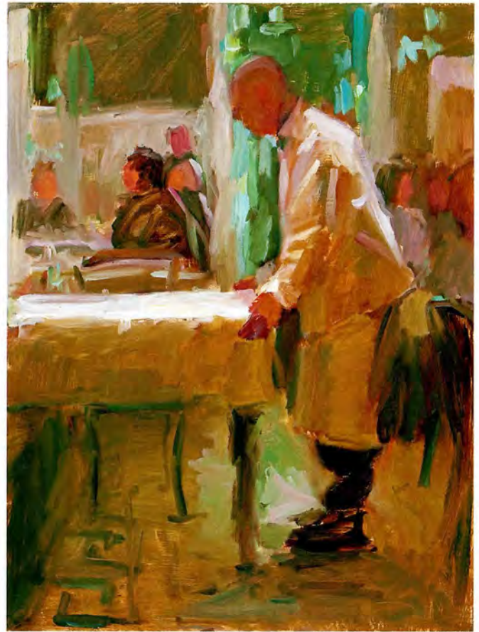
SECOND SEATING, OIL ON BOARD, 12 X 9"