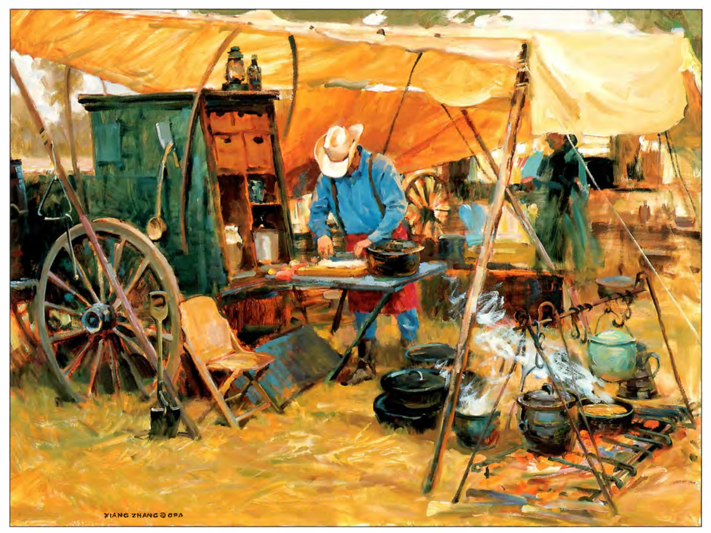
A Hard Day's Reward, oil, 25" by 32"