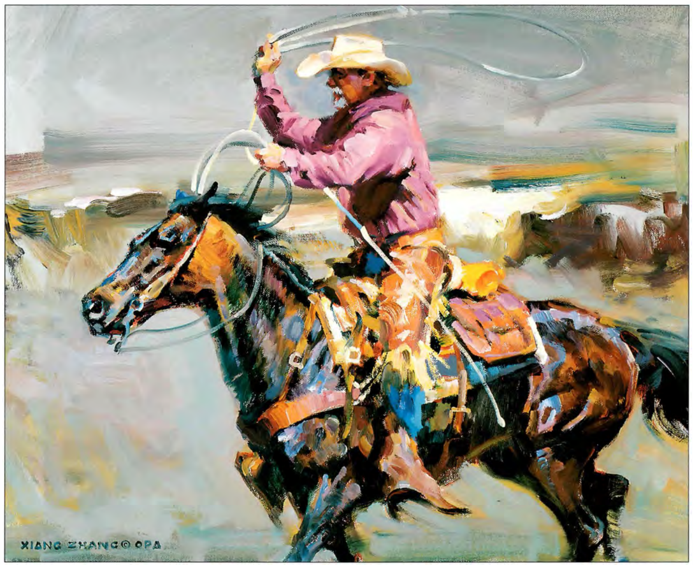
Rope Master, oil, 16" by 20"