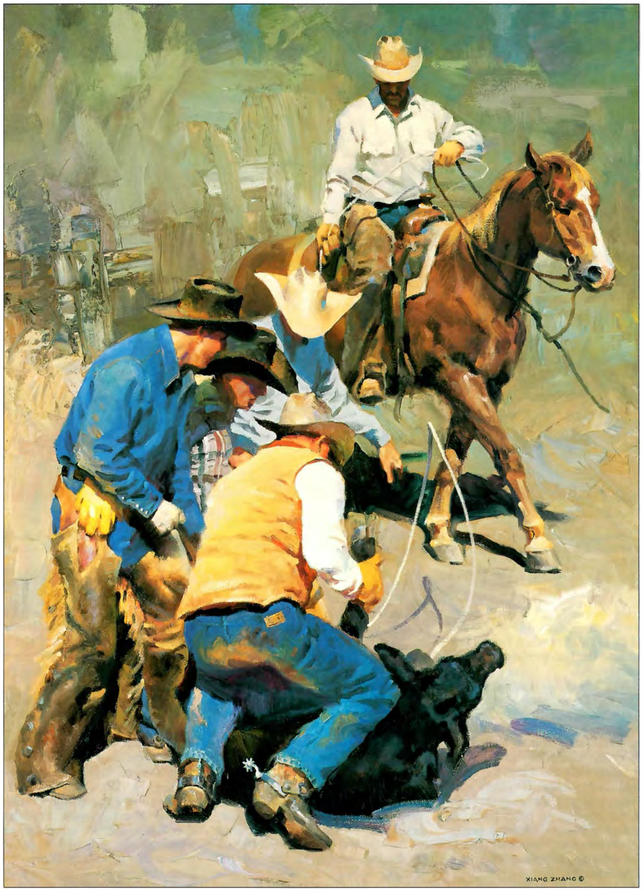
Ranch Wrestlers, oil, 60" by 40"

"Cowboys respect their work. They dress every morning as if they are going to a party but, after three hours of branding, their clothing is covered with calves' blood and mud. It was a windy day when I was on the fence taking pictures, with dust sweeping into the air and into my long lens, which made it hard to zoom in or out. Cowboys are tough. No matter if it's raining, hot, cloudy, or windy, they will get the job done."