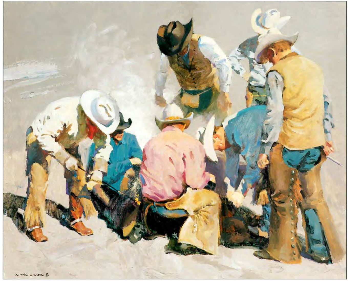
Branding, oil, 32" by 40"

"Just as I sign my name when I finish a painting, cowboys need to put their logo on the cattle. One of my leather chairs still has a logo 'CA' on it. No wonder it is worth so much trouble to brand the cattle. Of course, the cowboys give them shots and cut their horns, as well. The smell of burning hair and skin, the shouting of the calves, and the dust almost blocks the hot sunlight. All this made a wonderful atmosphere for the picture."