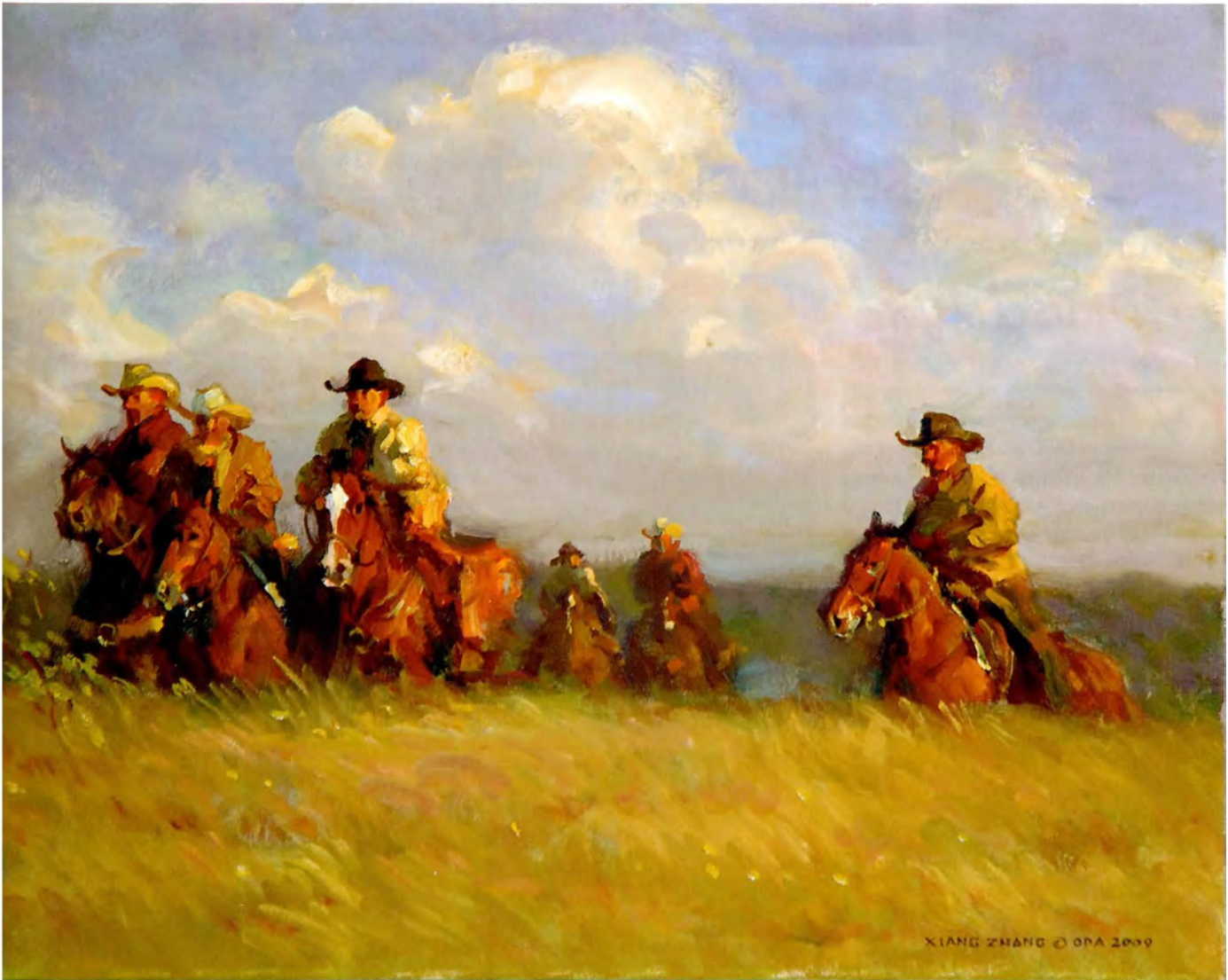
Circle T Gang , oil, 18 x 24"