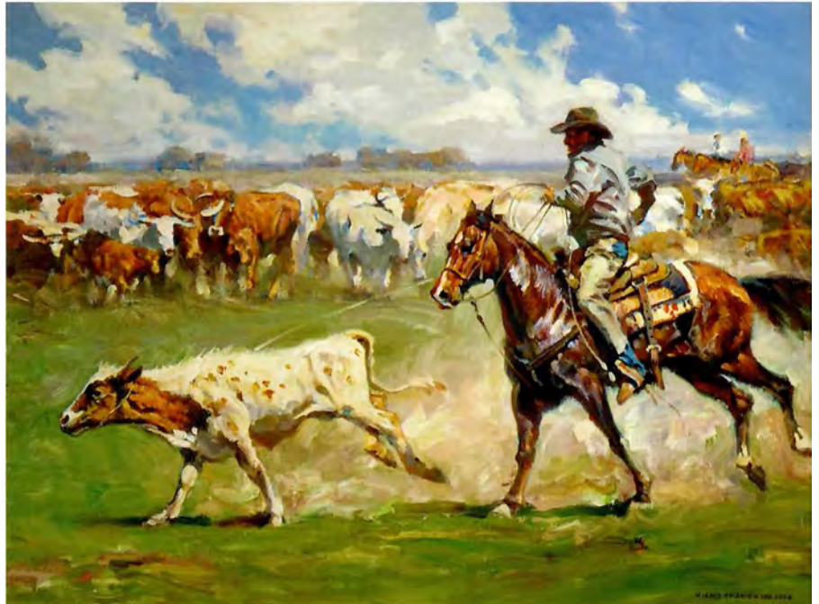
Unwanted Visitor , oil, 30 x 40"

In past compositions, Zhang focused on action and emphasized the cowboy's face. This new shift allows viewers to