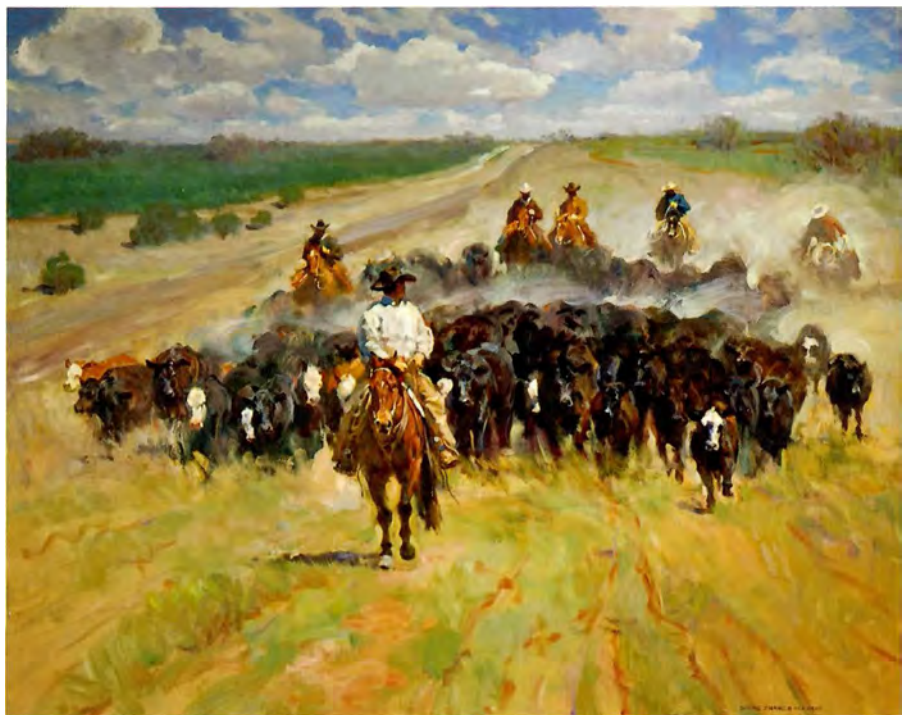
Rocker B Drive , oil, 48 x 60"