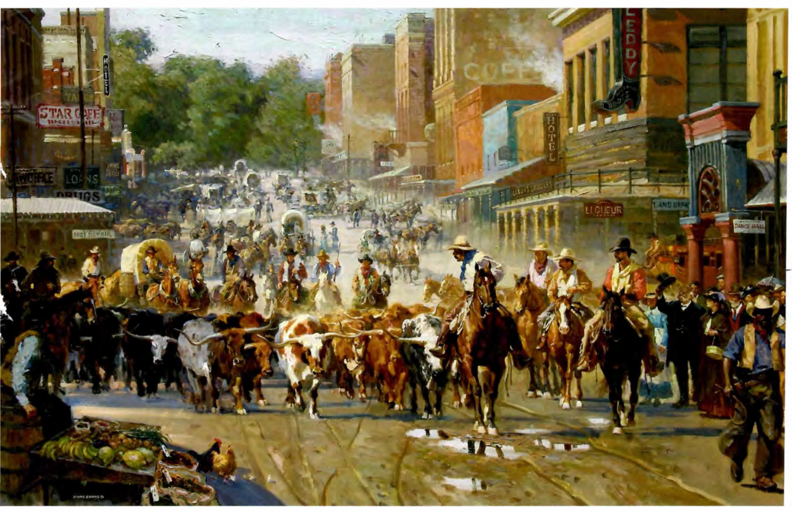
Arriving Fort Worth, oil on canvas, 50 x 82"