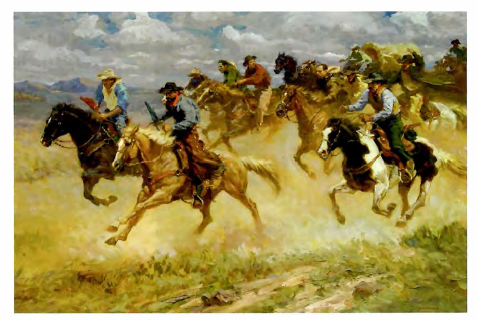
Boomers to Promise Land, oil on canvas, 36 x 54"

"America is a very young country—a mere 237 years old—compared with China, which is