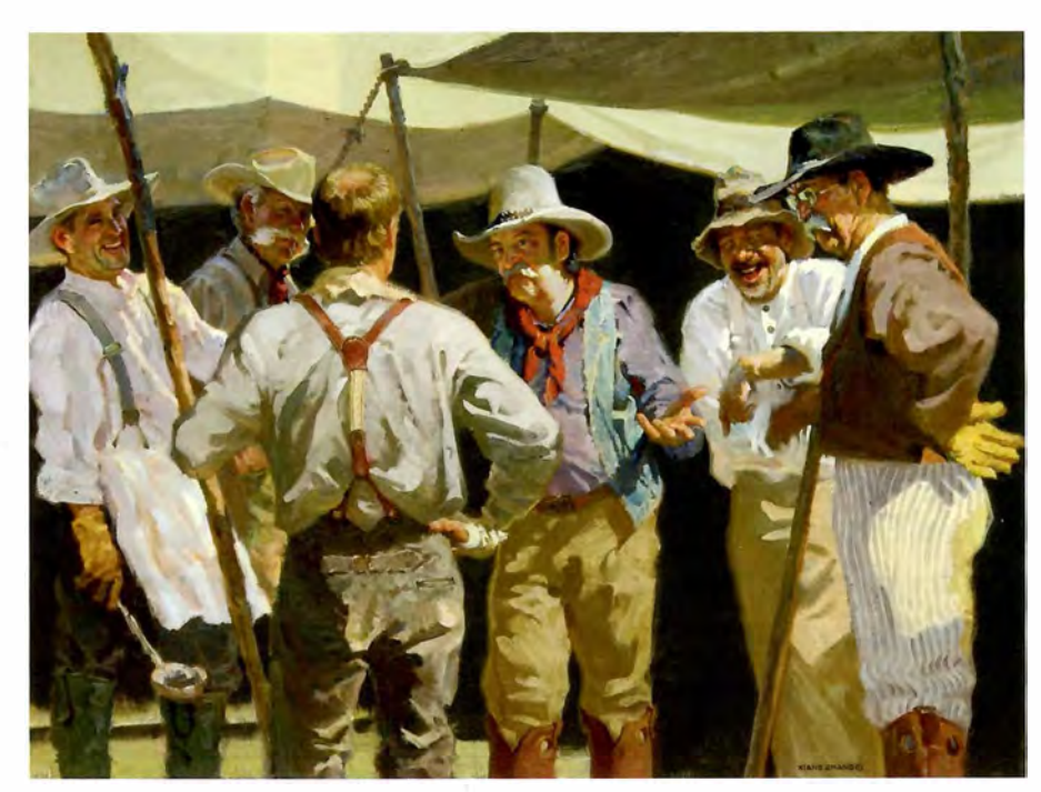
Telling Tall Tails, oil on canvas, 36 x 48"