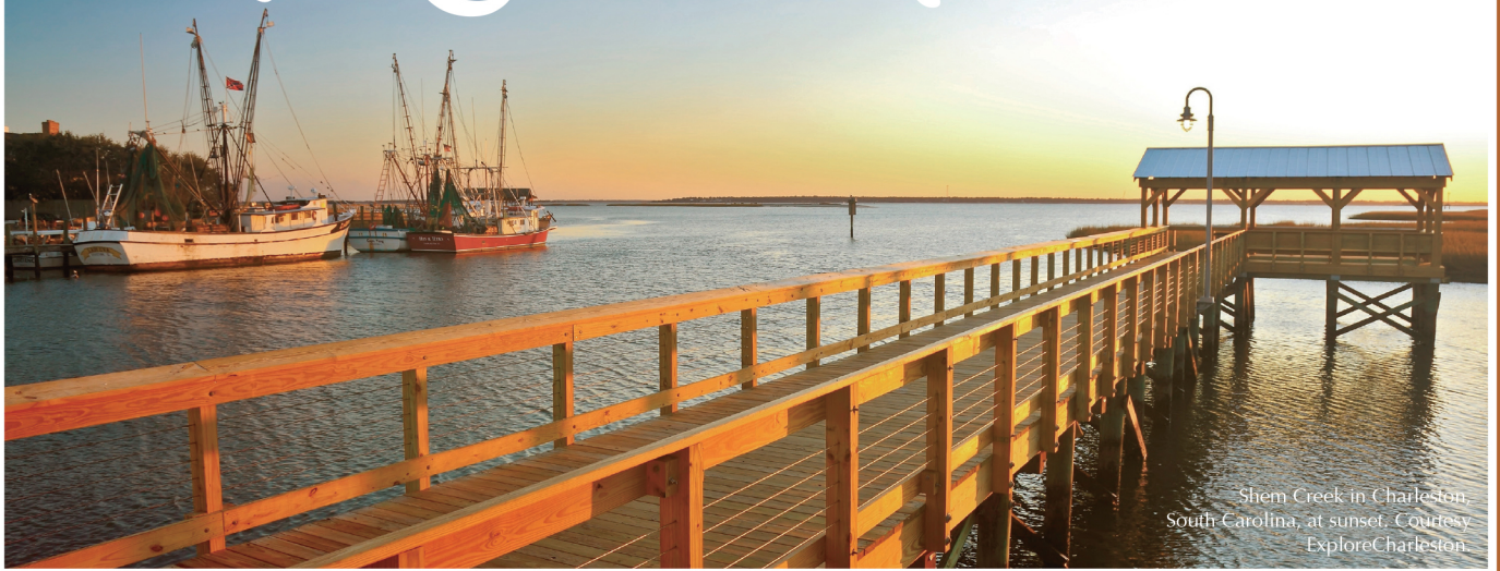
Shem Creek in Charleston, South Carolina, at sunset.

While the West often brings to mind classic images of Yosemite National Park, Death Valley, the Grand Canyon, the Sonoran Desert and so much more, the region of the United States located east of the Mississippi River has brought abundant inspiration to those inspired by the sentiments of the American West. The Mississippi River itself is a sight to behold. The behemoth river runs the northern/southern length of the country, from its source of Lake Itasca in northern Minnesota, down to the Mississippi River Delta in the Gulf of Mexico. All along the way, the river passes through the states of Minnesota, Wisconsin, Iowa, Illinois, Missouri, Kentucky, Tennessee, Arkansas, Mississippi and Louisiana.