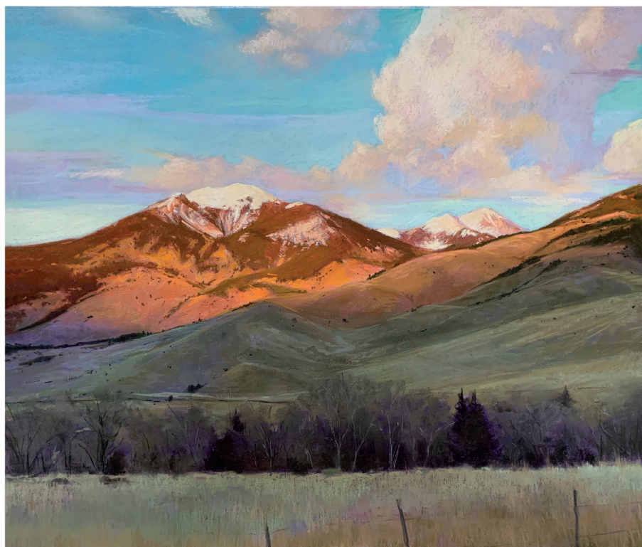
Lisa Gleim , Twilight's Descent , pastel, 20 x 24"

Gleim's pastels are in the collections of many individuals, corporations and museums.