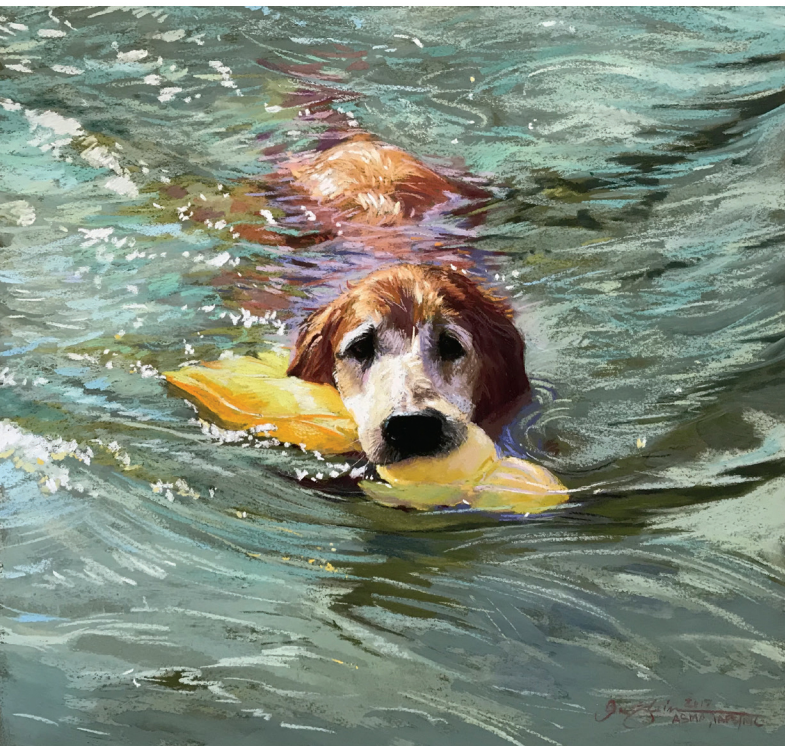
Lisa Gleim , Diesel , pastel, 18 x 18"