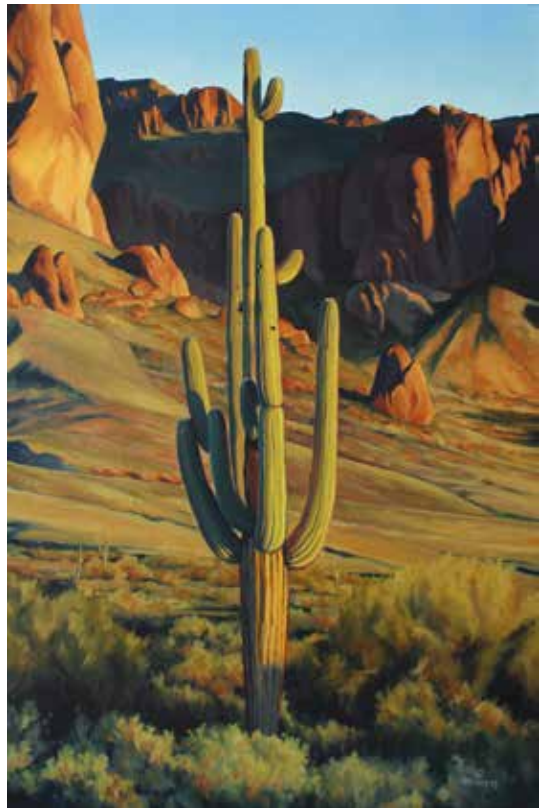
Between Jojoba and Heaven , oil on linen, 30 x 20". Sold at Medicine Man Gallery.