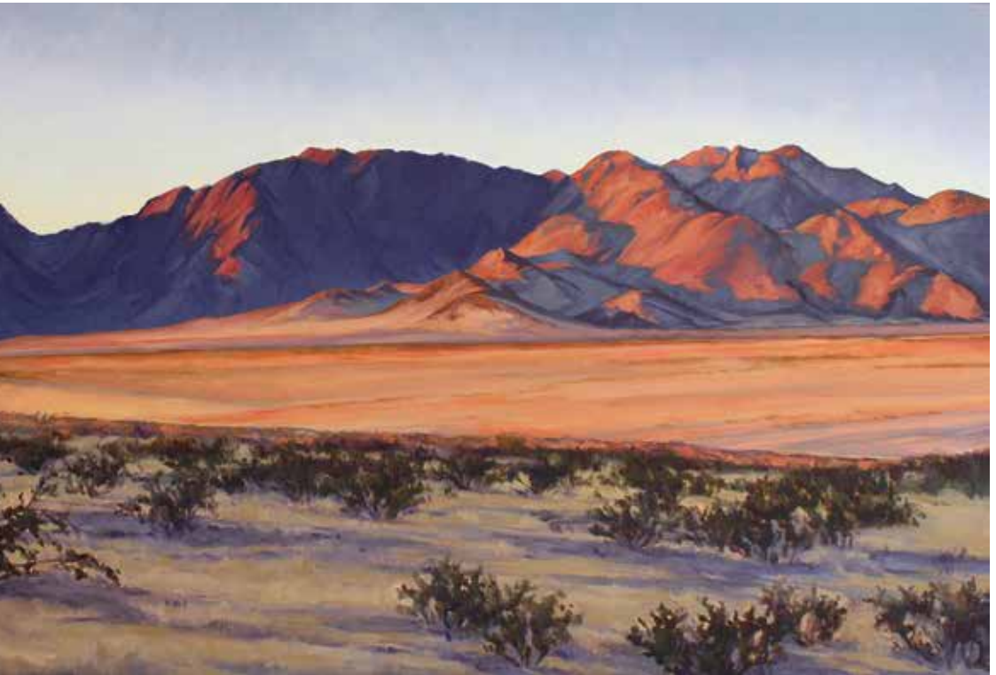
Deep Dusk , oil on canvas, 18 x 36". Available at Medicine Man Gallery.