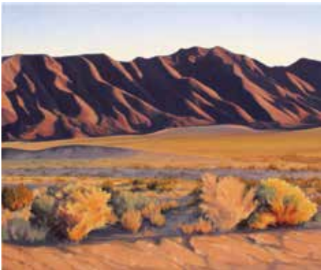
Golden Light , oil on linen, 20 x 24". Available at Medicine Man Gallery.