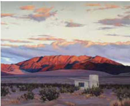
Wonder Valley Homestead , oil on linen, 24 x 30". Available at Medicine Man Gallery.