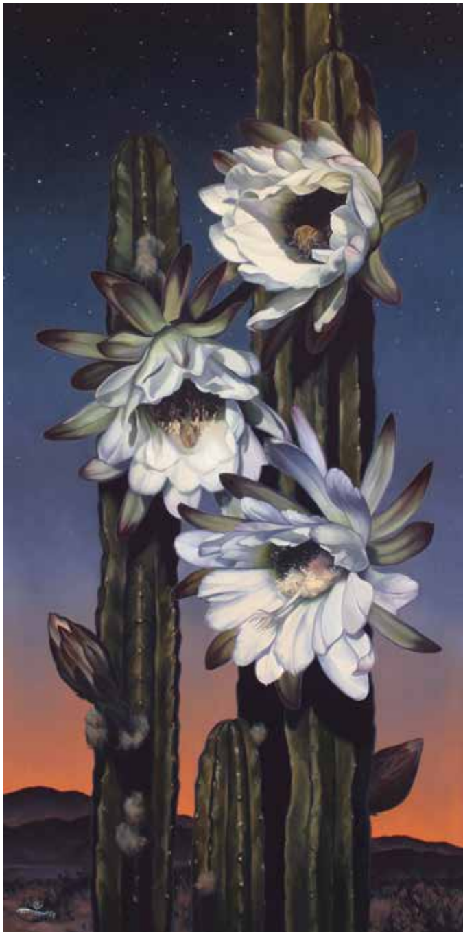
Born Under the Full Moon , oil on canvas, 36 x 18". Available at the 2024 Coors Western Art Exhibit & Sale.