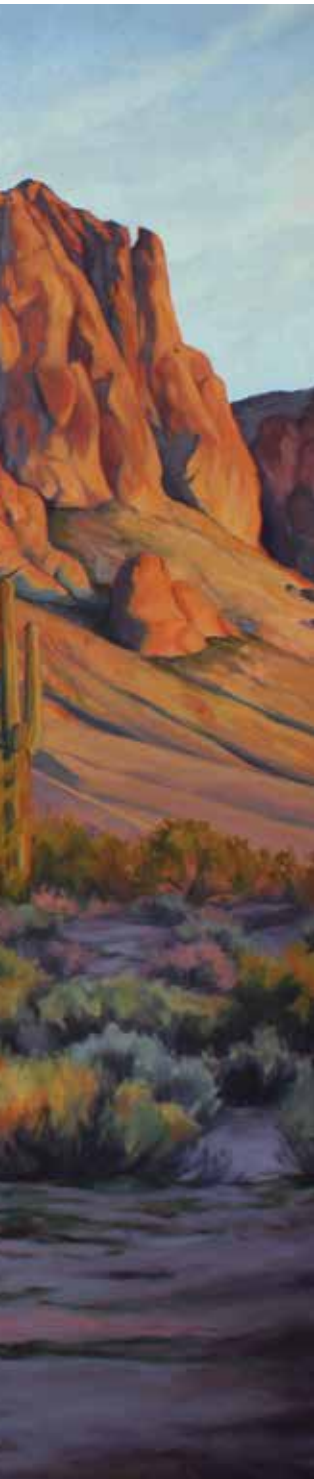
Sonoran Glory, oil on canvas, 48 x 48". Available at Medicine Man Gallery.