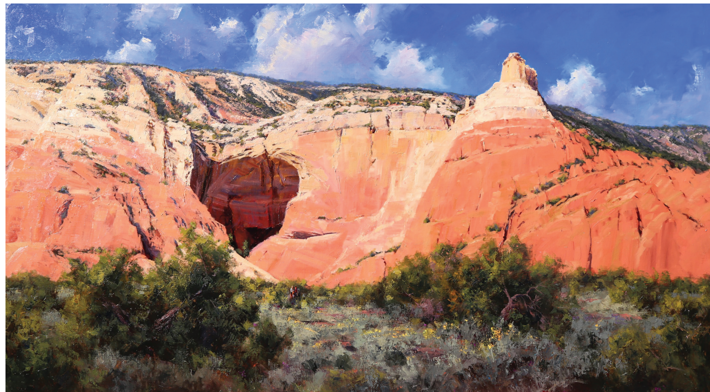
Echo Amphitheater (Abiquiu), oil, 44 x 78.