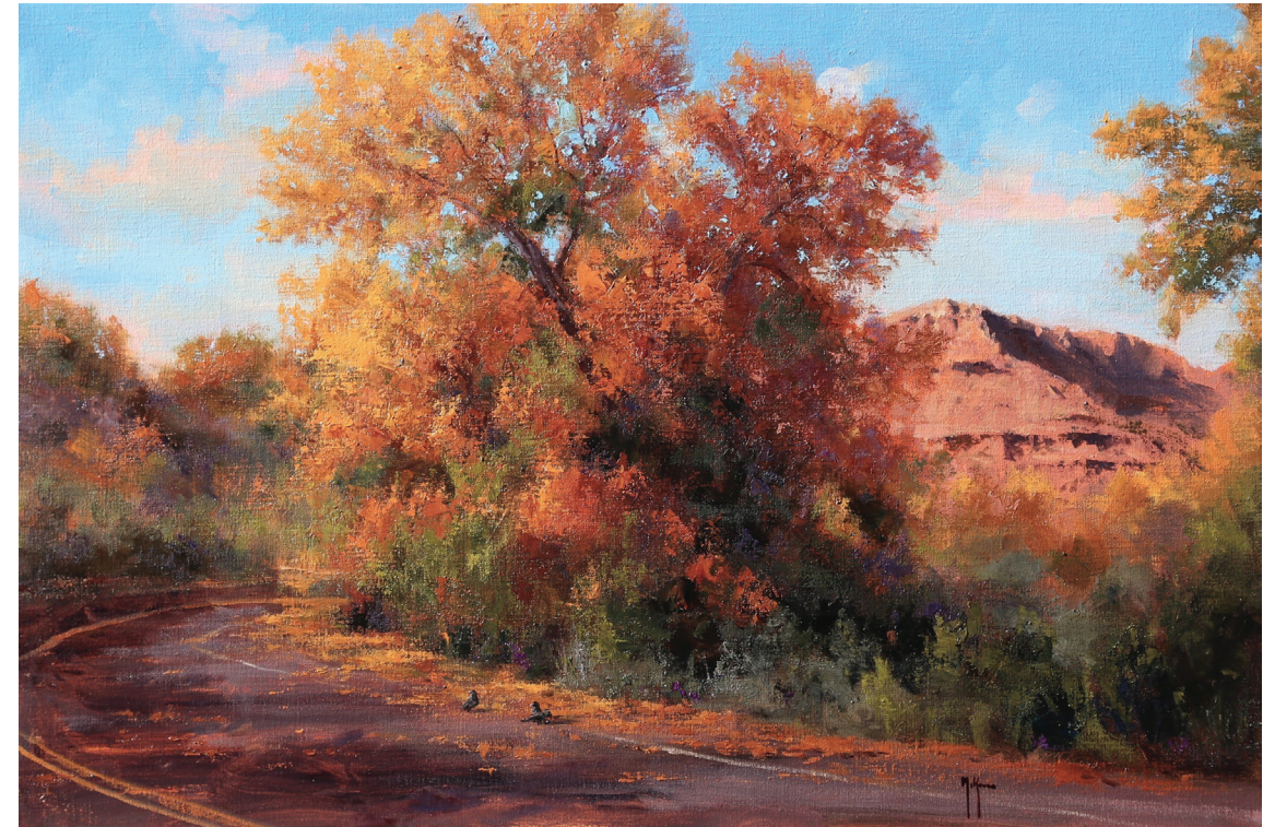
FROM TOP Road to Abiquiu, oil, 20 x 30.